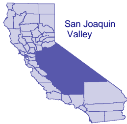
San Joaquin Valley